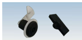
Standard lock Model: MS-01 Package:1pc