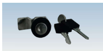
Key lock Model: MS705 -3E Package:1pc