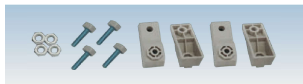
Wall mounting brackets Model: TXP-01 Package:4pcs/set